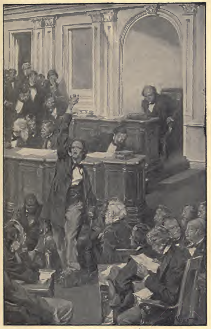
"'I hurl the everlasting curse of a Nation-""